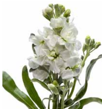
Stock - white, pink, lavender, lilac and purple.