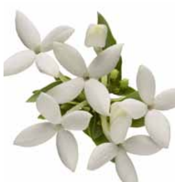
Bouvardia - white.