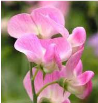
Sweet Pea - white, pink, lilac and lavender.