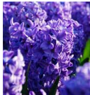
Hyacinth - white, soft pink, lilac and deep purple.