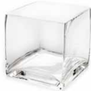
Glass Cube Vase