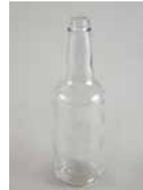
Tall Glass Bottle