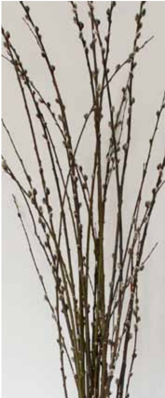
Tall sticks arrangement