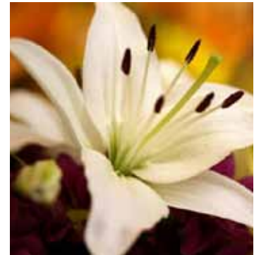
Oriental lily - white, soft pink, hot pink and lemon.