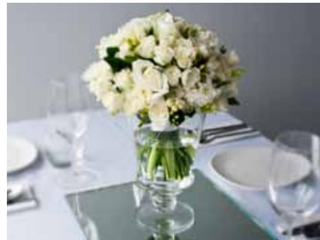
Taller chalice vase which features mixed seasonal florals.