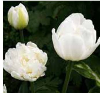
Tulips - any colour.