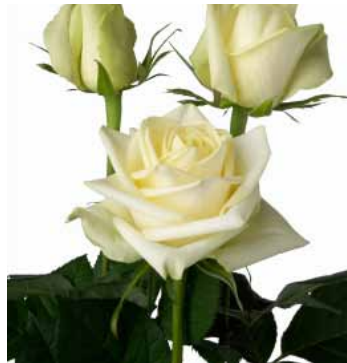
Roses - white, cream, lemon, soft pink, hot pink and red.