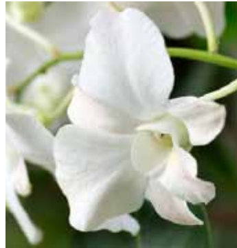
Orchids - white, blush, yellow, magenta, purple and green.