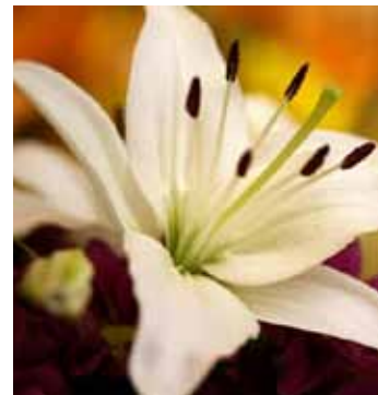
Oriental lily - white, lemon, soft pink and hot pink.