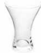
Glass Tapered Vase