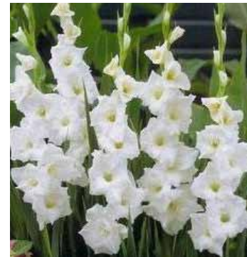
Gladioli - white, pink, yellow and red.