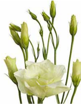
Lisianthus - white, cream soft pink, lilac and purple.