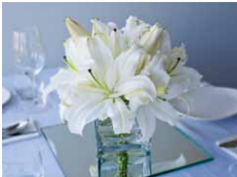
Glass cube vase featuring oriental lilies.