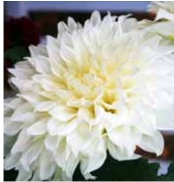
Dahlia - white, pink and burgundy.