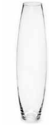
Glass Belly Vase