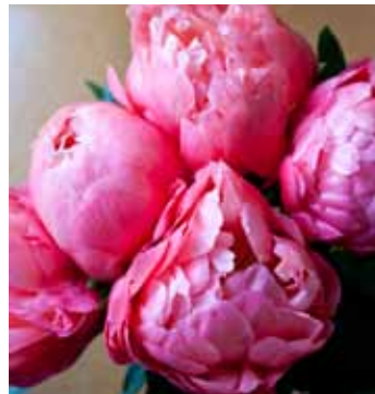
Peony Roses - (Limited availability) white, pink