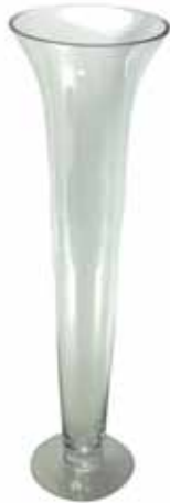
Glass Trumpet Vase