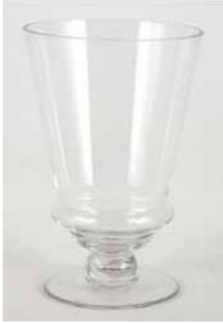
Glass Chalice Vase