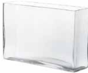
Glass Rectangle Vase