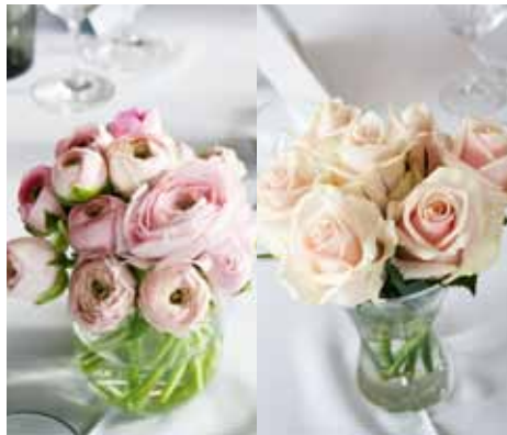
Long glass vase with 2 small vases to match.