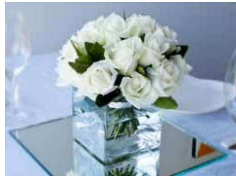
Glass cube vase which features a high volume of roses.