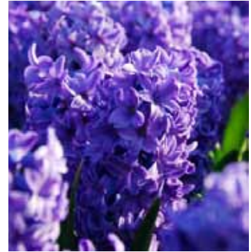
Hyacinth - white, ice pink, hot pink, lavender and purple.