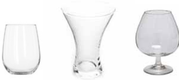
Grouped Glass Mix (Set of 3)