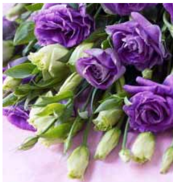
Lisianthus - White, cream, Lilac and pink.