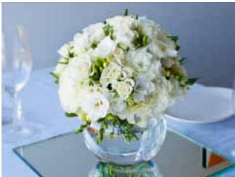
Medium fishbowl arrangement of mixed seasonal florals.