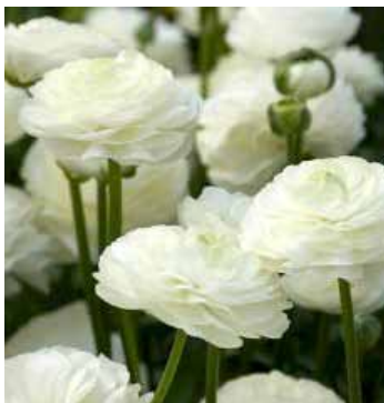
Ranunculus - White, soft pink, hot pink, red and yellow.