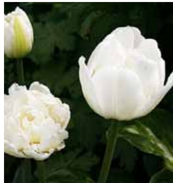
Tulips - white, lemon, soft pink, hot pink, red, purple.

These florals are available for weddings from September until the end November