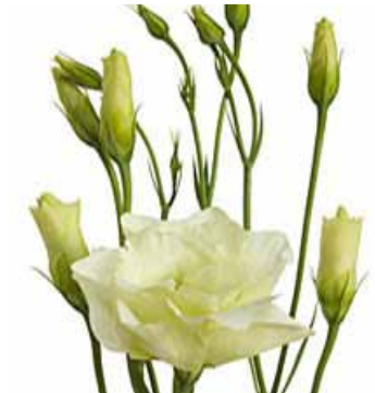
Lisianthus - white, cream soft pink, lilac and purple.