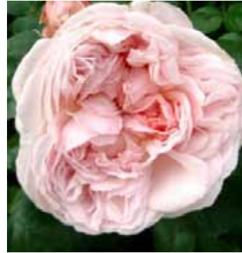
David Austin Rose - (POA, please contact us to discuss)

These florals are available for weddings from March until the end of May