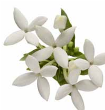
Bouvadia - white.