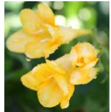
Freesia - white, yellow, pink, red and purple.