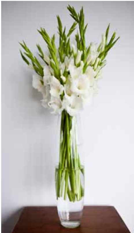
Tall rounded vase with gladioli blooms.