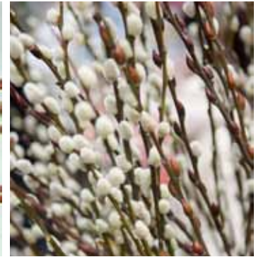
White Pussy Willow