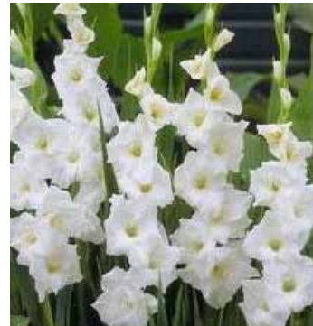
Gladioli - white, yellow, red, pink and orange.