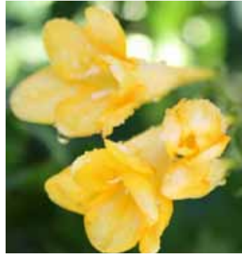
Freesia - White, Yellow, red, pink and purple.