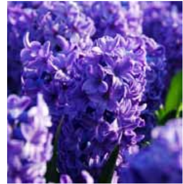
Hyacinth - white, soft pink, hot pink, lavender and purple.