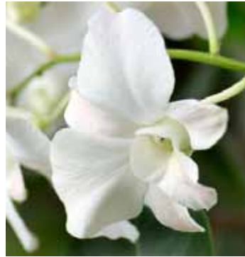
Orchid - white, blush, green, magenta and purple.