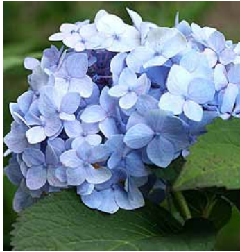
Hydangea - white, green, pink, purple, lilac, shade of blue.