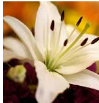
Oriental lily - white, lemon, soft pink and hot pink.