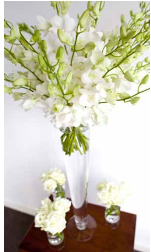
Tall trumpet vase with orchids and smaller vases to compliment.