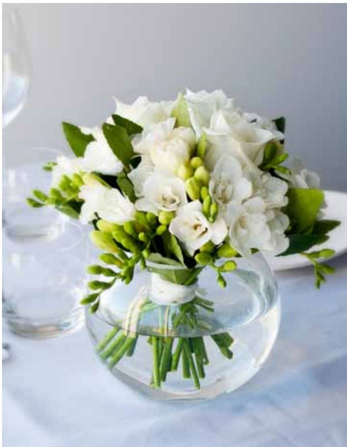
Pearl - Arrangement 3