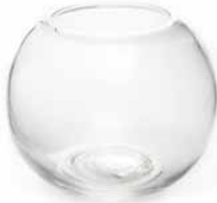
Glass Fishbowl Vase