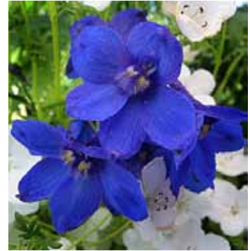
Delphinium - white, lilac and royal blue.