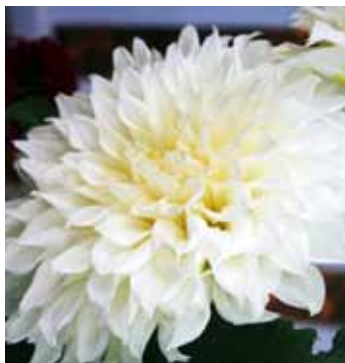
Dahlia white, pink and burgundy.