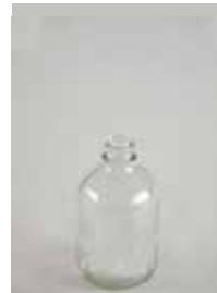
Small Glass Bottle