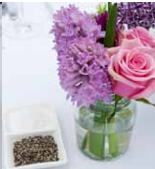
Grouped arrangement featuring 3 small glass vases, featuring florals to reflect the overall wedding floral theme.