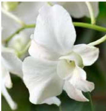
Orchid - white, blush, magenta, yellow and purple.