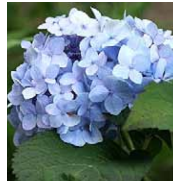
Hydrangea - white, pink, lilac, deep purple, green and blue.